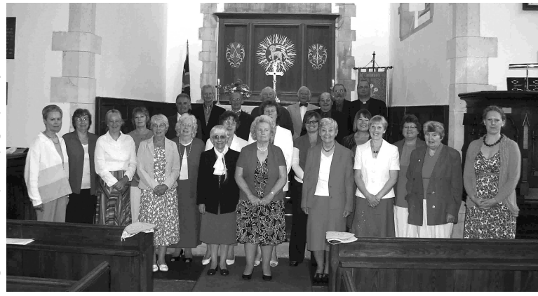
The Jubilee Choir performed some popular songs for the Party and choral songs for the Celebration Service in St. Peter's Church.

Jubilee Celebrations. Through the hard work of many individuals and groups, Oakford put on 4 days of celebrations to suit all ages and tastes. And all ages and tastes joined in with what was a really great weekend, one to be remembered for a long time to come. To all those who helped in any way, many, many thanks. To all those who came along and just enjoyed the fun