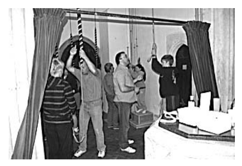
Teaching in Rackenford Church

We have just started some of our planned activities and are very grateful to Rackenford Church for allowing us to use their bells to teach some of the Rackenford school children to ring. We began with a 'teach the teachers' session on two consecutive mornings, when some of our ringers had the opportunity to learn 'how to teach' from three experienced members of the Guild of Devonshire Ringers. Three Rackenford school children (and their Headmistress) kindly agreed to be guinea pigs for us to practise on. We are now continuing to teach these children, together with others, once a week at lunchtime.