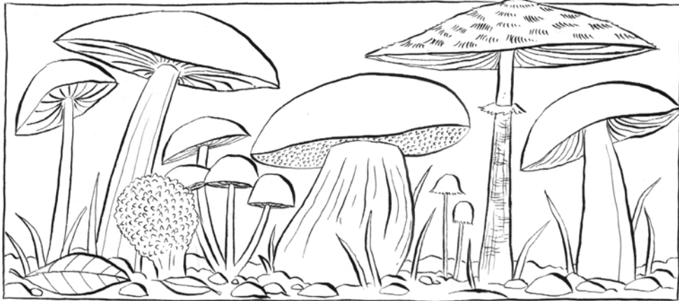
Mushrooms grow in the dark. We can grow with God, even when times are tough.

God is with us, and will give us good things when we are facing difficult times.